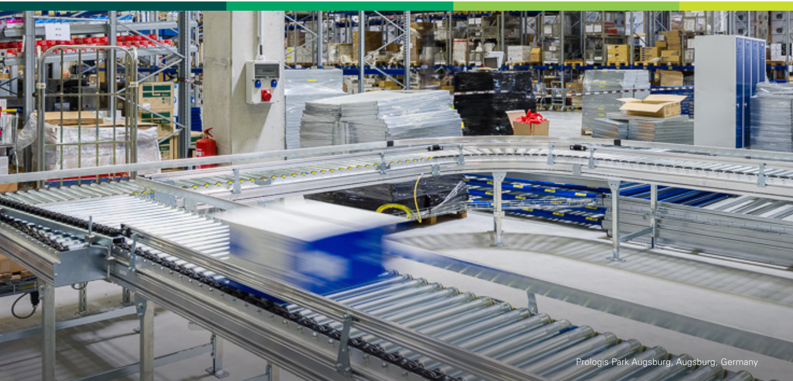
Prologis Park Augsburg, Augsburg, Germany